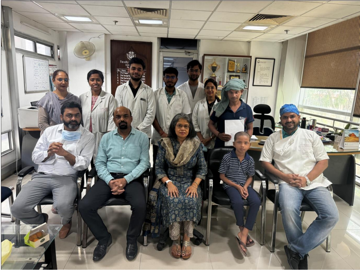
Dean, Faculty of Dentistry, along side patient, faculty, interns & staff from Department of Oral & Maxillofacial Surgery Faculty of Dentistry, Jamia Millia Islamia