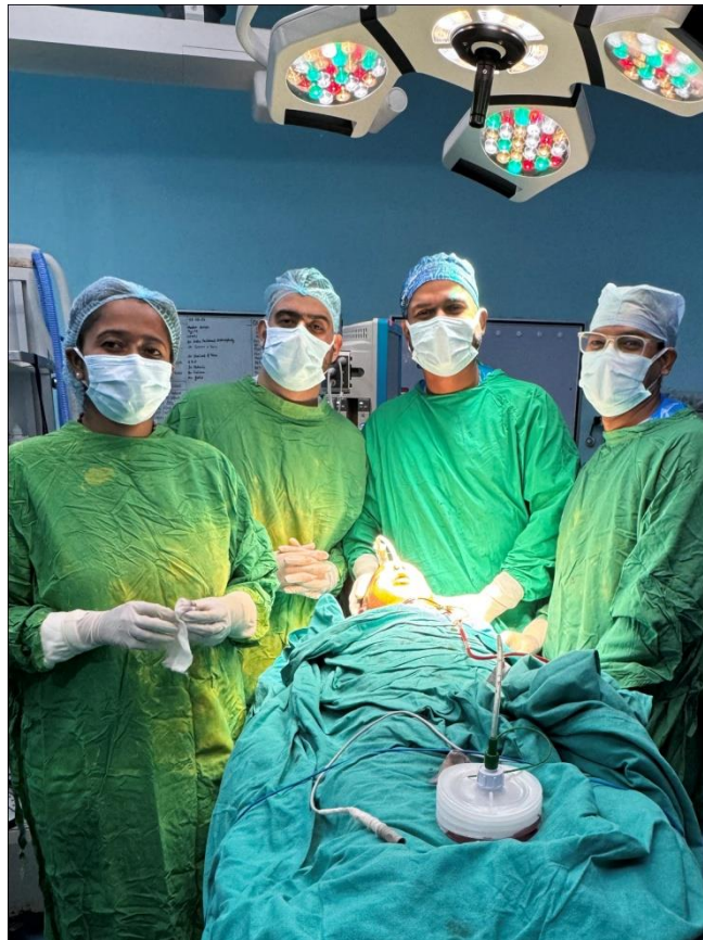
The Surgical Team