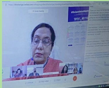
Guest Speaker Prof Sonal Saxena

Prof Sonal briefed the august audience on the various types of Covid - 19 vaccines under research across the globe, their timeline and features. Informing about the vaccines available in India she explained in a very simple way , various stages of vaccine development , advantages and disadvantages , expected adverse effects , high risk groups and contraindications .