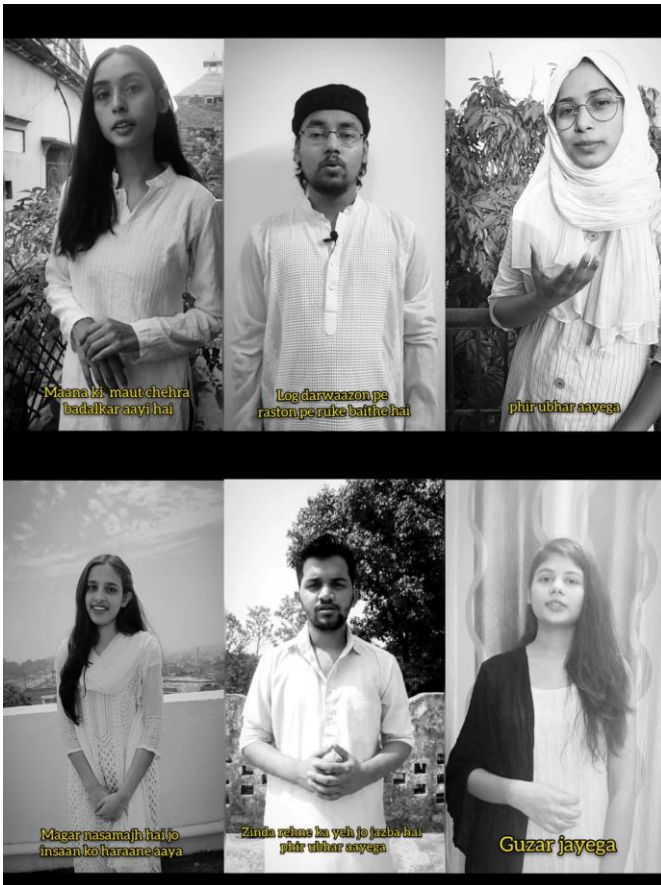
Poem : "GUZAR JAYEGA"