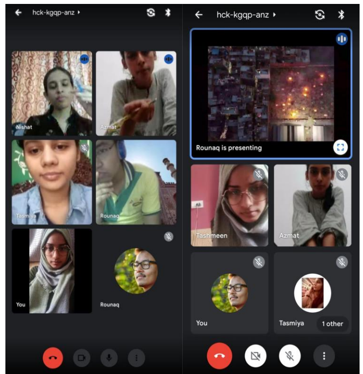
REHEARSALS OF THE EVENT