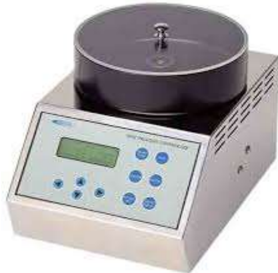
Spin Coating Unit