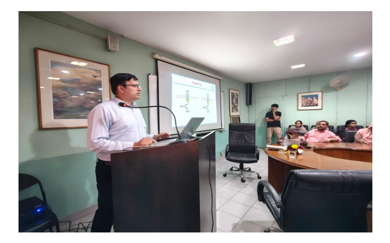
Dept. of Electronics and Communication Engineering, Faculty of Engineering and Technology Jamia Millia Islamia, New Delhi-110025 conducted an invited talk on "Low Power Architectures for A.I" on 2nd December 2021