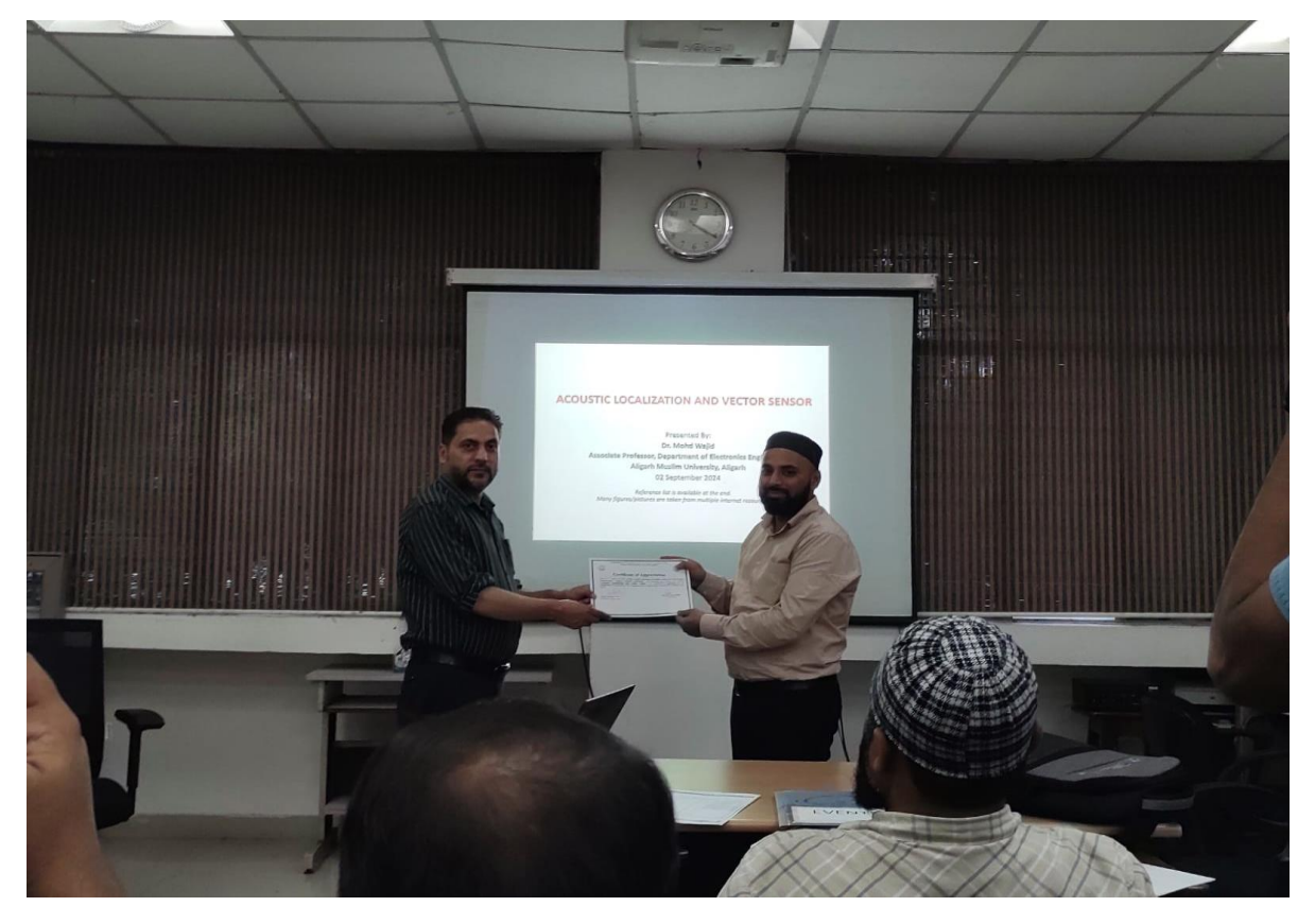
Dept. of Electronics and Communication Engineering, Faculty of Engineering and Technology Jamia Millia Islamia, New Delhi-110025 Conducted an invited talk on "ACOUSTIC LOCALIZATION AND VECTOR SENSOR" on 2<sup>nd</sup> December 2024