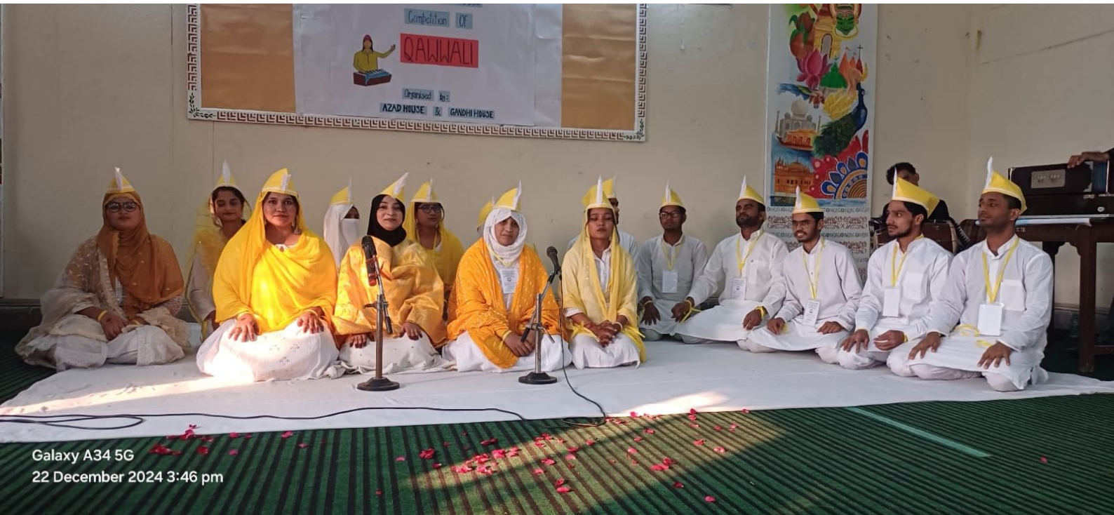
Galaxy A34 5G 22 December 2024 3:46 pm